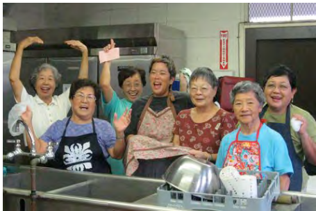
It was banzai! This was only half the group.

The BWA opened 2009 preparing delicious otoki of zenzai and o-soba for our Hoonko service in January. The shower cap gang made 100 servings for temple