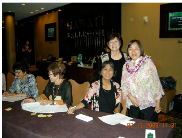
BWA Members man the check in table at the 2009 Aloha Banquet and are still smiling.