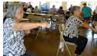
Punching movement is for warm up and flexibility.

1. Warm-up (gentle) movement to raise your core body temperature) for 5-10 minutes before exercising to avoid injury. 2. If sitting in a chair, you can still exercise by gently rotating ankles, bending knees, carefully lifting legs or arms, or flexing (tightening and relaxing) abdominal muscles.