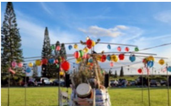
The yagura adorned with chochin and lights. The yagura was set up by temple members and Lanai City Lions Club. The lights were provided by the Yamafuji-Dunlap family from Kula.