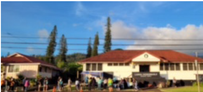
Lanai Hongwanji Mission temple with a line stretching down Frasier Avenue to attend the bon dance!

transported them to Lanai along with a travelling group of Lahaina Bon dancers. The Lanai residents started waiting in line for over an hour before the concession opened to purchase the homemade goodies that sold out immediately.