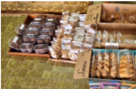
Delicious deserts brought over on the boat by the Maui Group.

On May 20, MUBWA volunteered to teach origami at the Maui Cultural Society's second annual Kodomo no Hi community event held at the Kaahumanu Shopping Center. The families and children spent an enjoyable time learning to craft various origami paper folding designs.