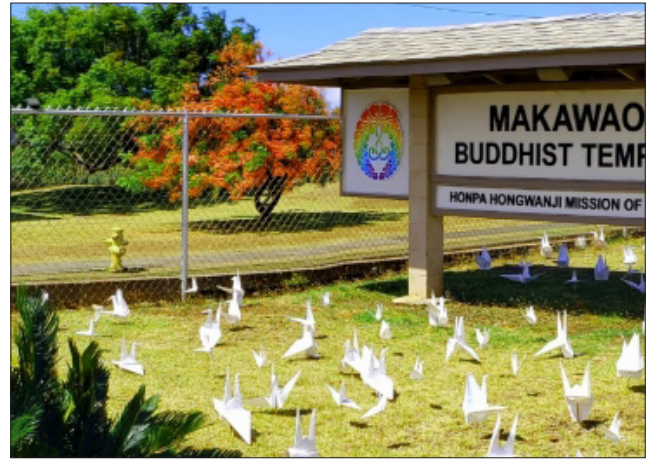
Makawao 2023 Peace Day crane display.

Lanai residents started lining up as early as 4:30 pm. The line on Frasier Ave went four houses down at its peak.