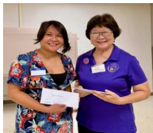
Project Dana Perpetual Award