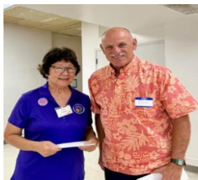
Honolulu Police Com- munity Foundation 3rd Year Dana Award