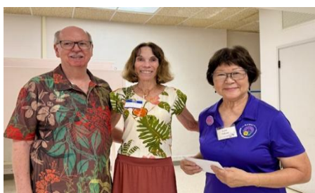
Mediation Center of the Pacific 2nd Year Dana Award