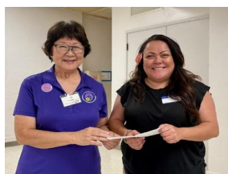
Ma'i Movement 1st Year Dana Award

"Nurturing Nembutsu-Cultivating Awareness" guided our conference topic, "Seeing Dementia...Through Eyes of Compassion".